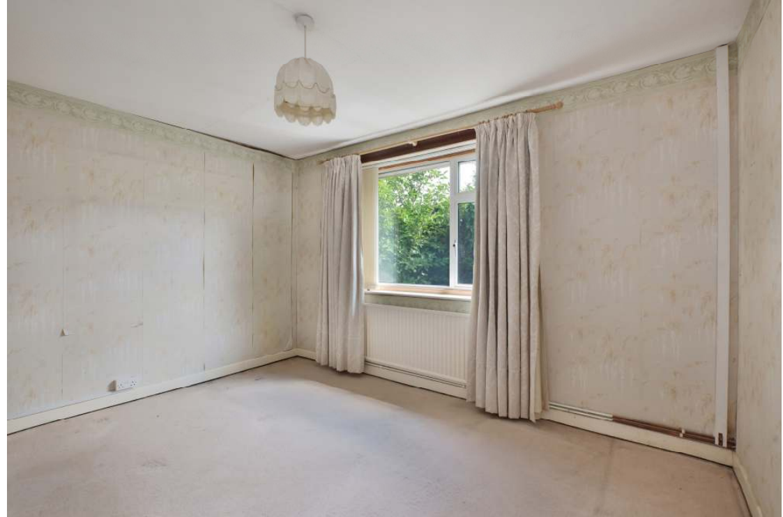
Three bedrooms with supporting bathroom