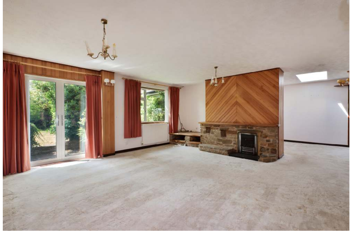
Hall / Living Room / Kitchen / Hall Leading to Bedrooms